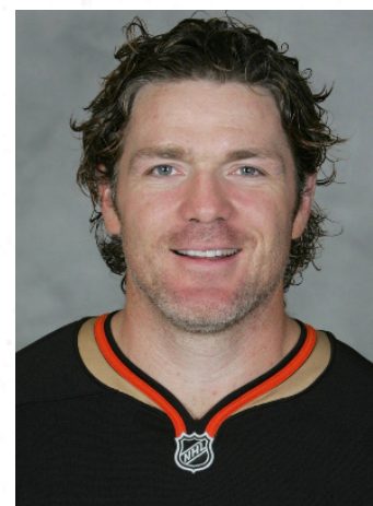
FEATURED NHL ALUMNI BRAD MAY

COMPANY IS PRESENTED WITH THE PENNANT TO TAKE HOME AFTER THE EVENT