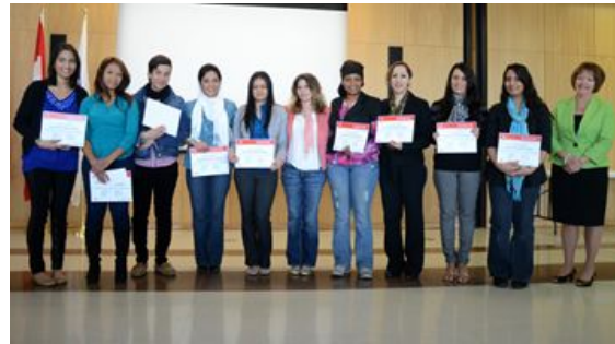
Members from Blue Door Shelters accept their team achievement awards during the 2014 Bhayana Family Foundation Awards at Vaughan City Hall Friday.